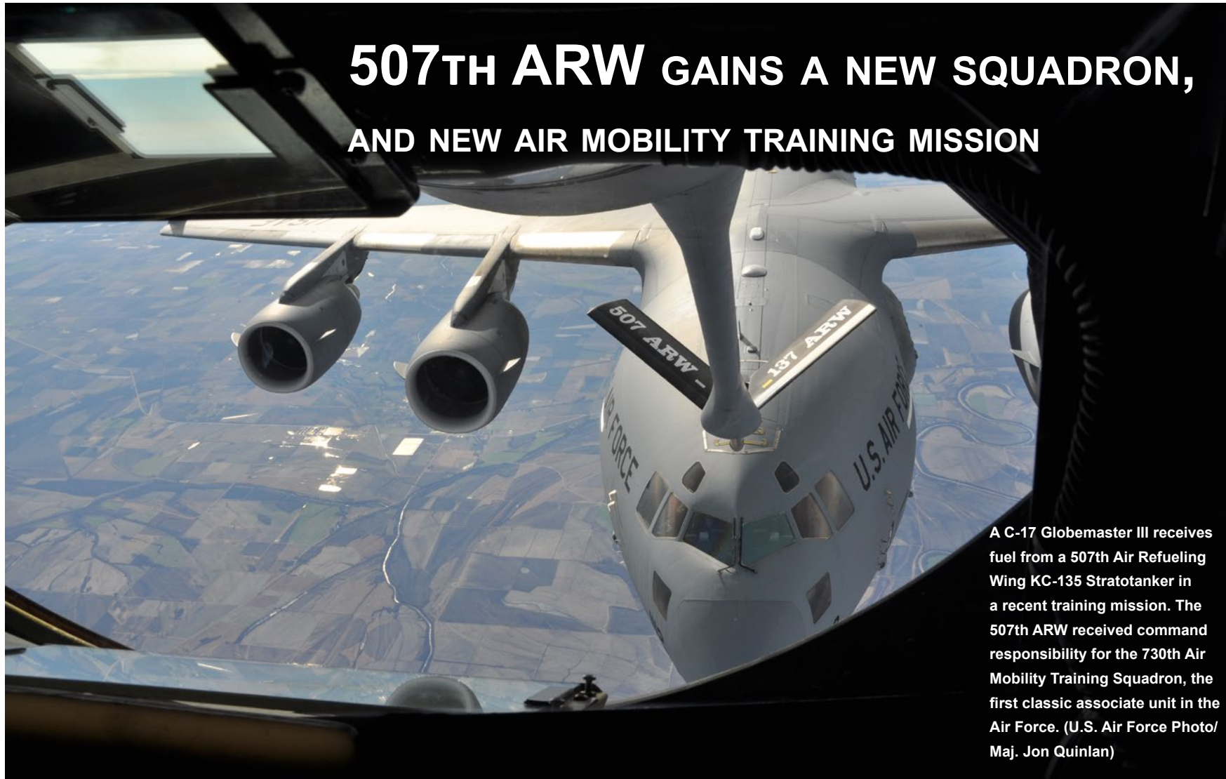
A C-17 Globemaster III receives fuel from a 507th Air Refueling Wing KC-135 Stratotanker in a recent training mission. The 507th ARW received command responsibility for the 730th Air Mobility Training Squadron, the first classic associate unit in the Air Force.

The 507th Air Refueling Wing gained a new squadron and a new training mission assuming command over the 730th Air Mobility Training Squadron out of Altus Air Force Base, Okla.