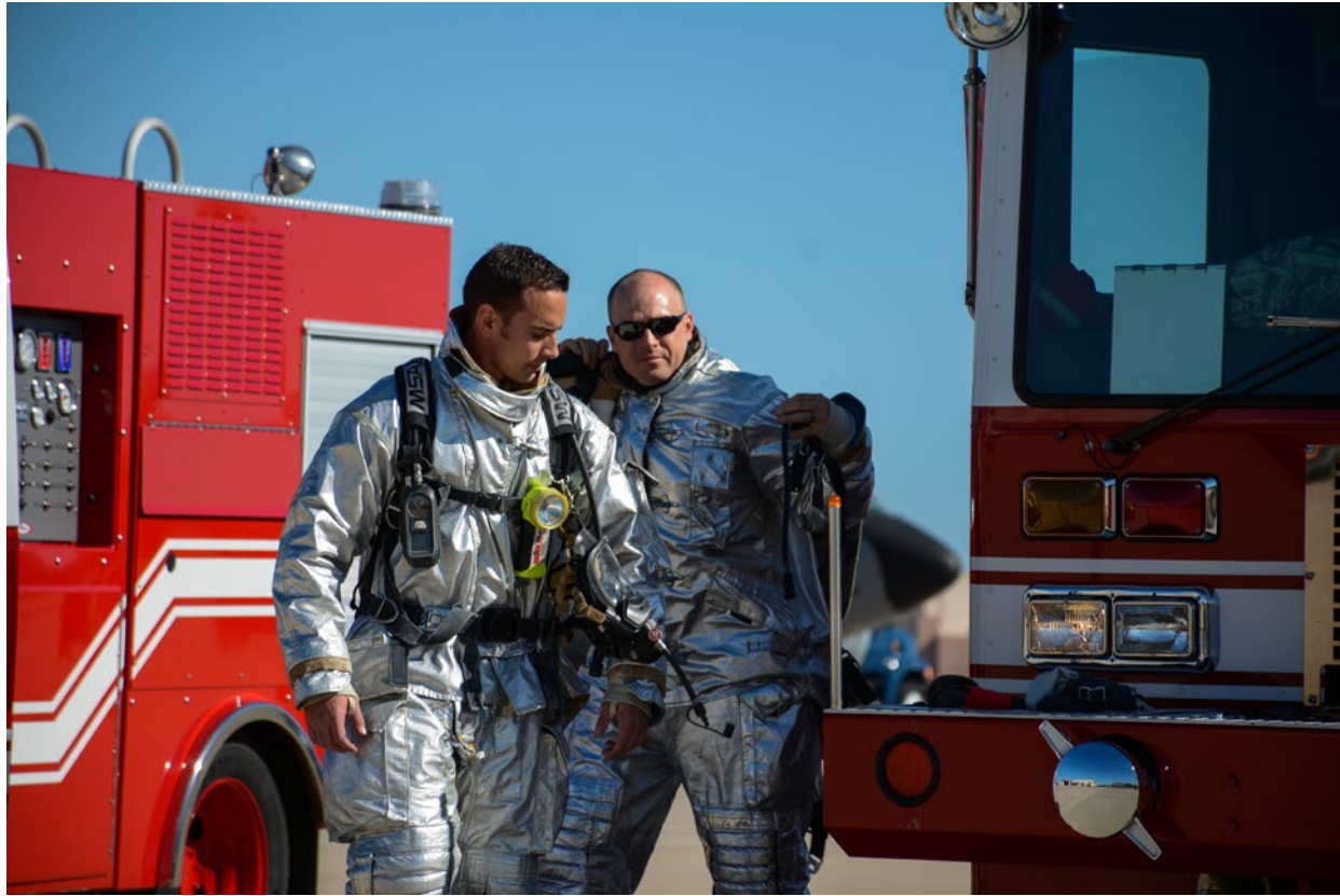
Firefighters from the 507th ARW Civil Engineer Squadron perform fire training aboard a KC-135R Stratotanker during a super unit training assembly September 5. The CES fire flight performs these super UTAs once a quarter in order to perform training scenarios that cannot be performed during normal drill weekends.

by Senior Airman Mark Hybers 507th Air Refueling Wing Public Affairs