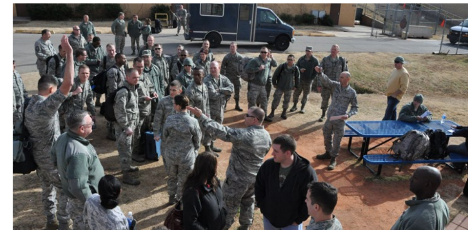
Airmen from the 507th Air Refueling Wing prepare to deploy to Southwest Asia in 2013.

Airmen should contact their local unit deployment manager or base deployment manager for more information.