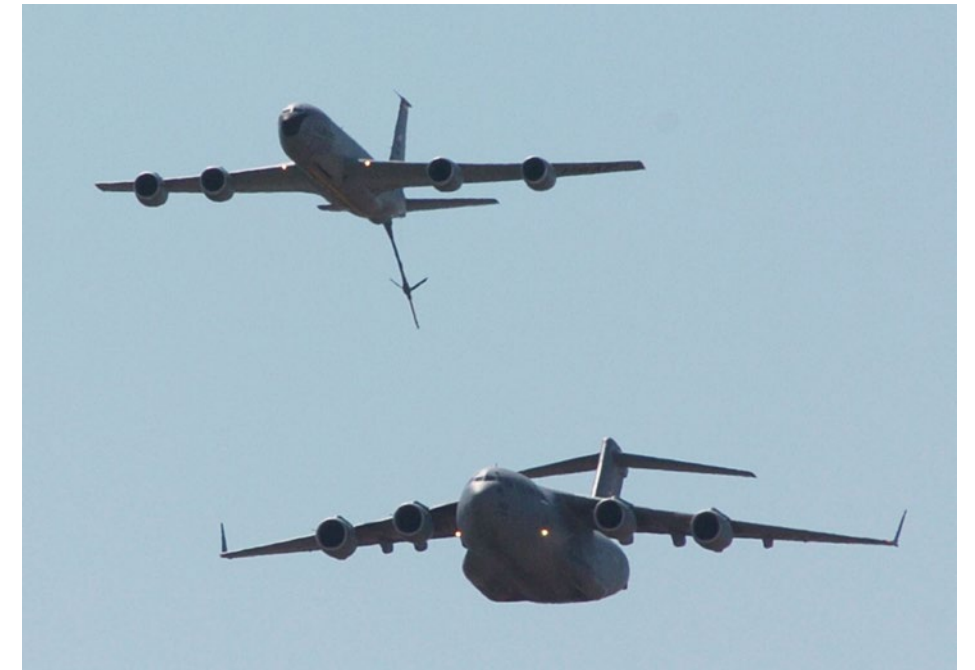
The 730th Air Mobility Training is charged with training aircrew on the C-17 Globemaster III (Above), KC-135 Stratotanker and in the future, the KC-46 Pegasus aerial refueling aircraft.

Military Airlift Squadron became the first associate reserve unit, which is when a reserve unit shares facilities and aircraft with an active duty unit. It was redesignated the 730th Airlift Squadron (associate) on Feb. 1, 1992 and then deactivated on March 19, 2005.